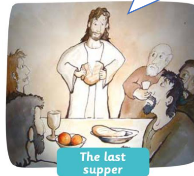
The last supper

What can you remember about the Easter Story?